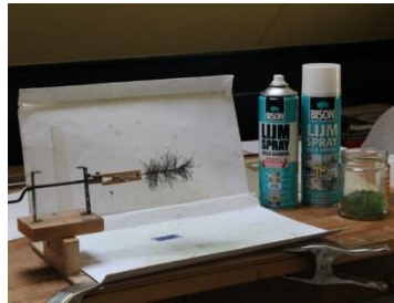
Fall Yellow Coarse Turf

17. Prepare the tree for the spray adhesive ( 3M 77 spray adhesive )