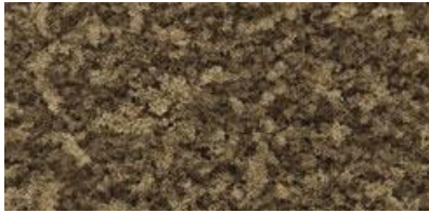
Earth Coarse Turf