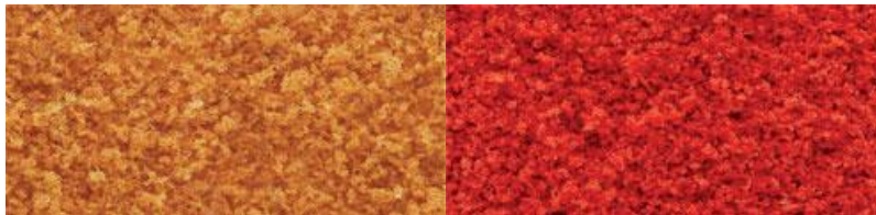
Fall Orange Coarse Turf