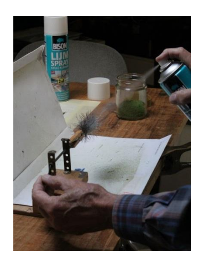
18. Apply a coat of adhesive spray on the tree.